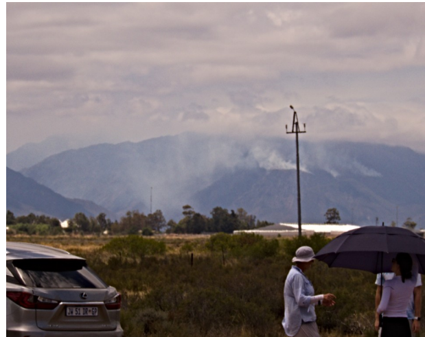
Fire on Keeromsberg.

great success. The weather was a little unusual for Worcester with a massive thunderstorm one afternoon. Apart from a lightening strike starting a grass fire on the nearby mountains the storm damaged some transformers leaving the airfield without power for around 24 hours.