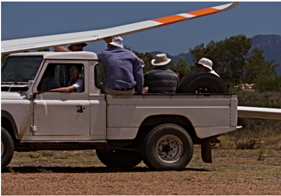
Pilots delivery Service